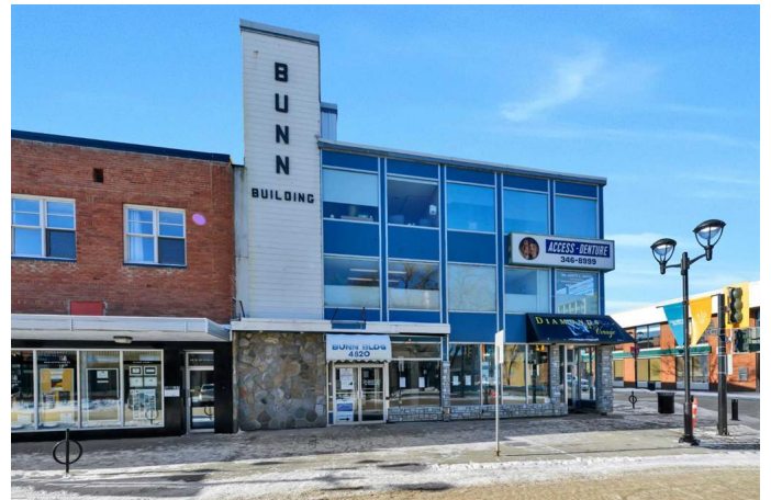
2nd Floor-4820 50 Ave, Red Deer, AB

Come view this office space in the Bunn Building! Great exposure along Little Gaetz with access to many popular shops and restaurants, and plenty of action in the summertime with markets happening every week. This space is 1,612 sq ft and is located on the 2nd floor, but has elevator access. The space has 8 separate rooms that could be used as offices, one is large enough for a boardroom with a sink and cabinetry for storage. There is plenty of natural light streaming in through large windows. Building offers common washrooms and 1 elevator. Monthly rents are all inclusive with no other expenses and there are no long term commitment required.